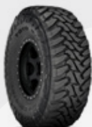
Toyo Open Country M/T