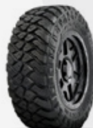
Maxxis RAZR MT