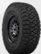
Toyo Open Country R/T