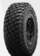
BF Goodrich M/T KM3